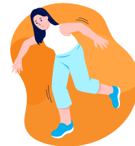
Tripping or losing balance unexpectedly

Even if relapses and MRI activity are under control, disability progression may still happen due to the ongoing chronic smoldering process.