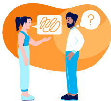
Struggling to find the right words

Disability progression can include a wide range of symptoms, such as: