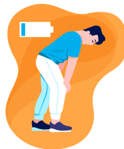
Lacking the energy to do typical activities