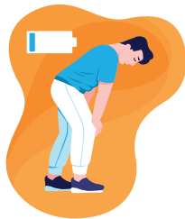
Lacking energy to do usual activities