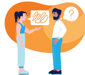
Struggling to find the right words