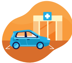
Parking closer to your destination